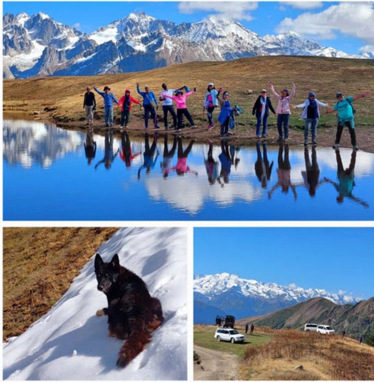
Lake Koruldi Mestia

Day 9 (19 JUNE 2025) Mestia-Kutaisi Drive 136kms to Zugdidi to visit Dadiani Palace. Once considered one of the most eminent palaces in the Caucasus, today it house a History and Architecture Musuem.We should arrive at our agro hotel nicely located in the lush Kutaisi countryside, by early afternoon. Wine and dine will be the order of the rest of day with cultural folk performance, Georgia is after all, the 'cradle of wine' with wine-making evidence found here dating 8000 years back! Overnight Kutaisi(B,D)