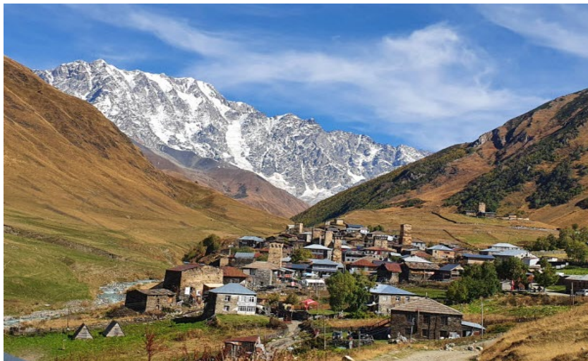
UNESCO list Ushguli Village in Mestia

Day 4 (14 JUNE 2025) Okatse Canyon-Tskaltubo A short drive will bring us to Okatse Canyon and we will take in a nice and easy 2-3hrs 6km morning walk along a stone path and boardwalk in the Dadiani Forest. Panoramic views from the 20m extended platform will be a highlight. Visit a Soviet-era relic, Tskaltubo Spa Resorts. Once a gem of Soviet Wellness Tourism for the Soviet elites, today most of the palatial buildings are now like 'lost in time' majestic monuments. Overnight Kutaisi (B)